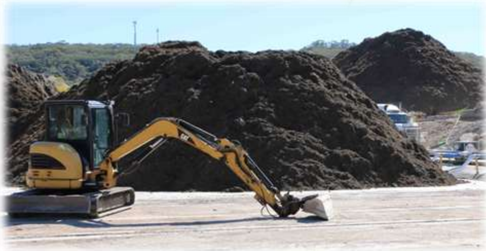
Shredded vegetation on the new AERO-SORB Platform, 28 September